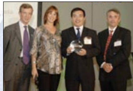
Photo: Winner of the Corporate Developer of the Year Award - CLP Group